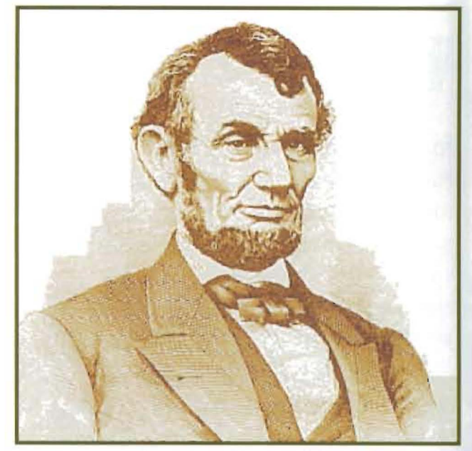
"...to care for him who shall have borne the battle, and for his widow and orphan..."